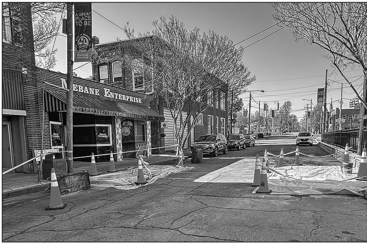
CITY OF MEBANE

The patching, milling, and resurfacing portion of the project will occur overnight since Turner Asphalt will need to close Clay Street and Fourth Street to through traffic. Closing down these roads is a safety measure to protect both Mebane residents and the contractor. For those unfamiliar with patching, it repairs damaged asphalt surfaces, like potholes or cracks, by filling or